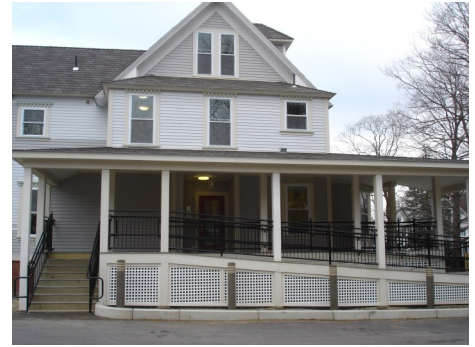
Greenfield house with 10 apartments