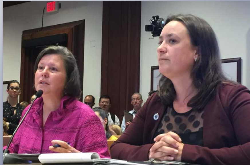
Senator Comerford and Representative Sabadosa deliver a resolution from the Northampton City Council

Municipal leadership plays a critical role in making state policy change happen. Greenfield City Council can join the cities of Northampton, Springfield and other Eastern MA communities to pass a Resolution urging the Legislature to adopt Right to Counsel and HOMES bills. It will make a meaningful difference!